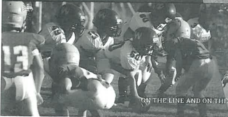
ON THE LINE AND ON THE FIELDS WITH YOUR TEAM