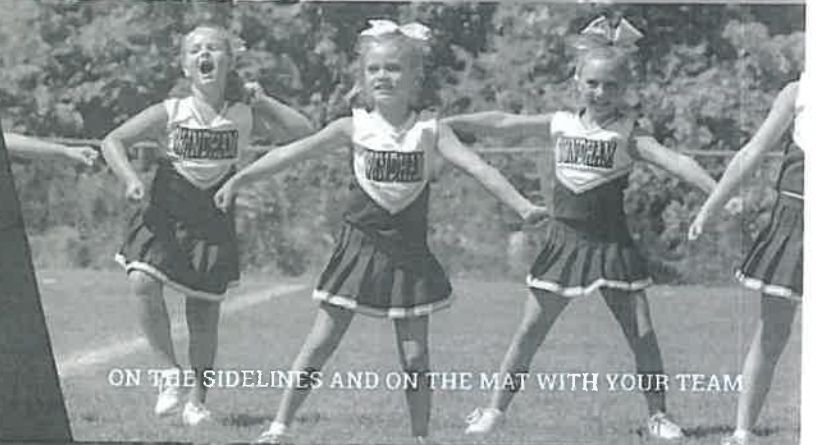
ON THE SIDELINES AND ON THE MAT WITH YOUR TEAM

FOR MORE DETAILS PLEASE VISIT WINDHAMWOLVERINES.COM